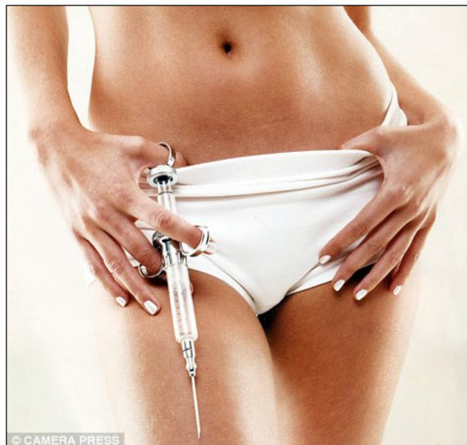
Dream body: But would you spend thousands on fillers before bearing your hands, feet and knees?