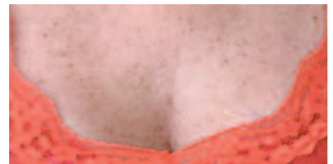
the décolletage before and after treatment